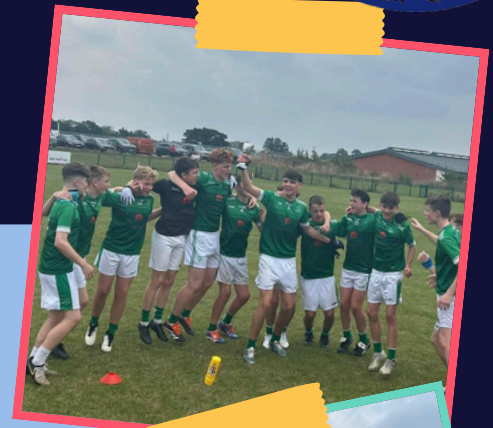
Plate Winners - John Mitchels, Warwickshire

Shield Winners - North London Shamrocks, London